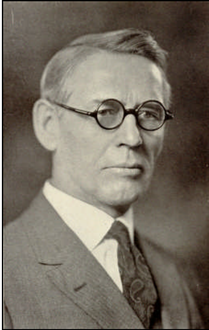
Last picture of Charles A. Lindbergh, Sr., taken January, 1924. He died May 24, 1924.

natural resources and the products of the people's daily toil furnished temptations to speculators. They required certain laws to secure special privilege. These they sought and secured by tempting those in political power. The laws were made to suit the tempters, which accounts for the shift of the wealth from the producers to the speculators.