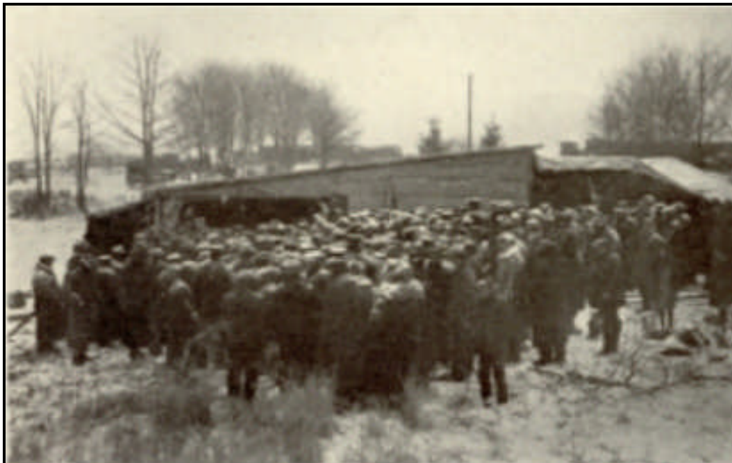
County Nonpartisan League Meeting held in machinery shed at Echo, Minnesota, because of refusal to allow meeting in town.