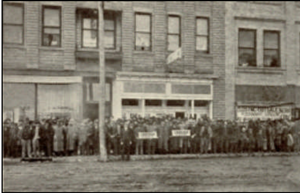
Lindbergh-for-Governer meeting at Detroit Lakes, Minnesota, April 26, 1918, Lindbergh standing between banners.