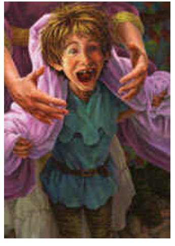
"But Dad, the emperor is naked!"