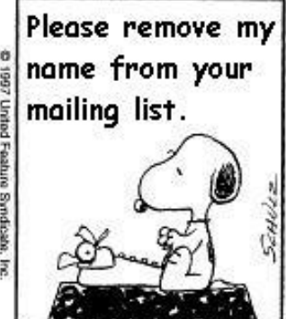
Copyright 3 1997 United Feature Syndicate, Inc. Redistribution in whole or in part prohibited