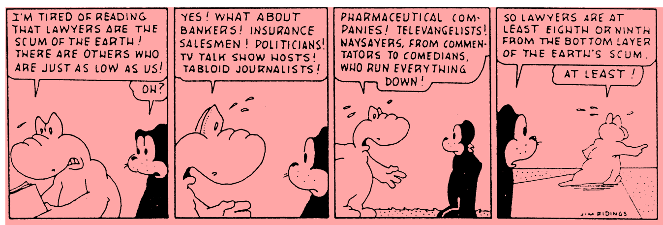
Reprinted by permission of Jim Ridings. There are six, 48-page issues of "The Cheese Weasel" available for $2.95 each, postpaid, from Side Show Comics, POB 464, Herscher, Ill. 60941.

(which allegedly turned lead into gold) as one of the most extraordinary acts of political and spiritual legerdemain the world has ever imagined.