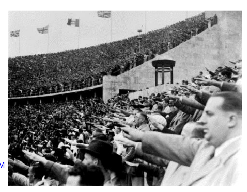
Picture: Following blindly either under assumption or simply based on what they have been told the definitions of words of law mean, the lemmings contribute to their own enslavement. by wors hipping and forgiving their enslavers.

+++"TRADE OR BUSINESS" DEFINITION SCAM +++"US CITIZEN" DEFINITION SCAM +++"EMPLOYER" and "EMPLOYEE" DEFINITION SCAM +++"PENALTY OF PERJURY" SCAM +++"WITHOLDING" SCAM +++"SOCIAL SECURITY NUMBER= TAXPAYER ID" SCAM +++"TAXPAYER" vs "TAX" "PAYER" DEFINITION SCAM +++FEDERAL JURISDICTION IN STATES SCAM +++FEDERAL DISTRICT COURT PARTY TO EXTORTION SCAM +++"LIABILITY" SCAM +++"NFTL" vs "FTL" SCAM +++JURY "DIDN"T PAY FAIR SHARE" SCAM