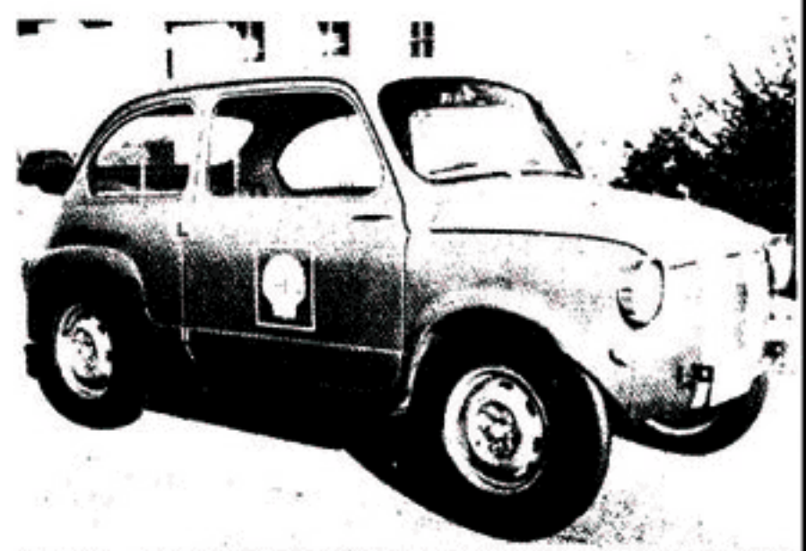
Plate 12.2 A modified 1959 Flat 600 which achieved 244.35 mile/US gal in the 1968 Wood River competition