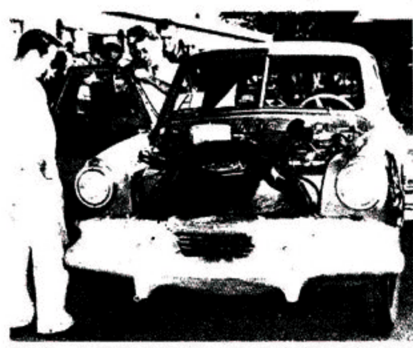
Plate 12.1 A modified 1947 Studebaker which achieved 149.95 mile/US gal in the 1949 Wood River competition