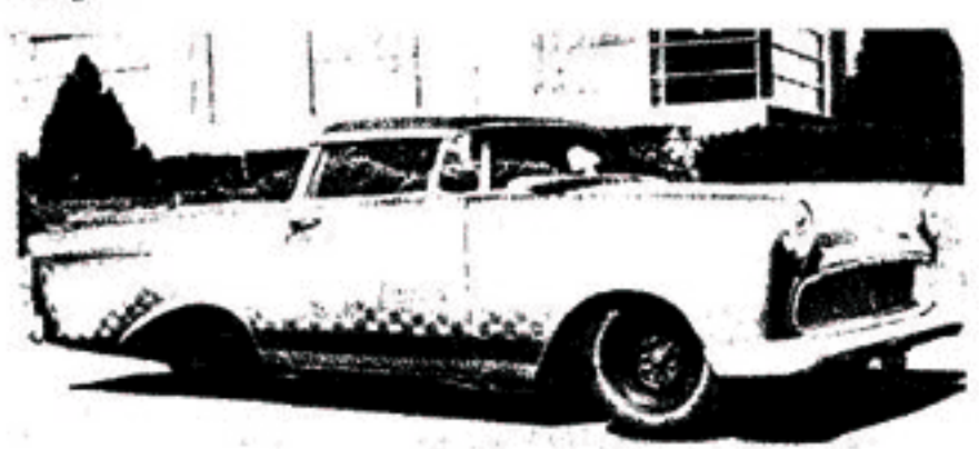
Plate 12.3 A modified 1959 Opel which achieved 376.59 mile/US gal in the 1973 Wood River competition

River class for slightly modified production cars. Driving style was not restricted, but the extent to which a normal production car could be tuned was limited to changes in carburation and ignition timing. The event was run on a closed airfield circuit with a minimum average speed of 30 mile/h (48 km/h) enforced. Awards for best miles per gallon and best ton miles per gallon (miles per gallon multiplied by vehicle weight) have been made. Small cars (Fiat 500s, Imps, Minis) have managed about 90 mile/gal (3.1 l/100 km) under these conditions, the current best being 96 mile/gal (2.94 l/100 km) by a Mini 1000 driven by B. D. Caddock. Larger cars, notably British Leyland 1800s, have given best ton miles per gallon results, 109.0 ton mile/gal having been achieved by I. C. H. Robinson. These impressive values were due more to the driving technique employed than to engine tuning.